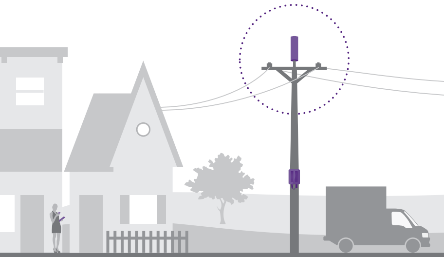
Small cells on utility poles

Every type of wireless infrastructure has its benefits, and none can completely replace another. Your community likely needs a combination of both small cells and macrocells (towers and rooftops). Because small cells use less power and more nodes can be placed closer together, they are often a good solution to relieve congestion issues. But it's important to note that an SCS is usually installed as a complement to existing infrastructure—not a replacement.