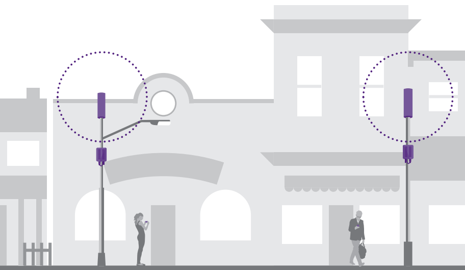
Small cells on streetlights and slimline poles

So how do carriers expand a network that's at or near capacity? One option is a small cell solutions (SCS) network. SCS use a series of small, low-powered nodes that are placed on existing infrastructure like utility poles and streetlights in existing rights of way. These nodes are then connected by fiber optic cable to maximize capacity.